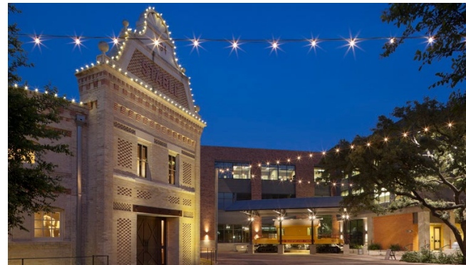
The Can Plant Residences is located on the site of a former brewery that was founded in 1883.

PRPI is based on comprehensive policies, strong governance, reporting practices, and research. It focuses on five primary areas of ESG to guide decision-making: environmental performance, occupant experience, community impact, climate resilience, and managerial excellence. PRPI outlines ESG expectations throughout the property lifecycle, starting with an analysis of key ESG factors during the due diligence phase. This continues into operations with an iterative performance improvement cycle. ESG considerations are also incorporated into disposition