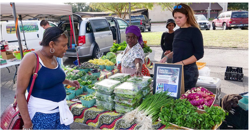
Farmers supported by Plant It Forward grow fresh food for their communities.

Plant It Forward is a Houston-based nonprofit with the mission to empower refugees to develop sustainable farming businesses that produce fresh, healthy food for the local community.